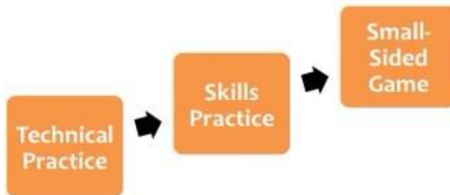
Traditional "Chaining" Method